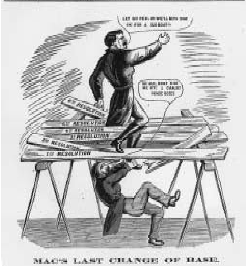
Figure 16. "Mac's Last Change of Base."