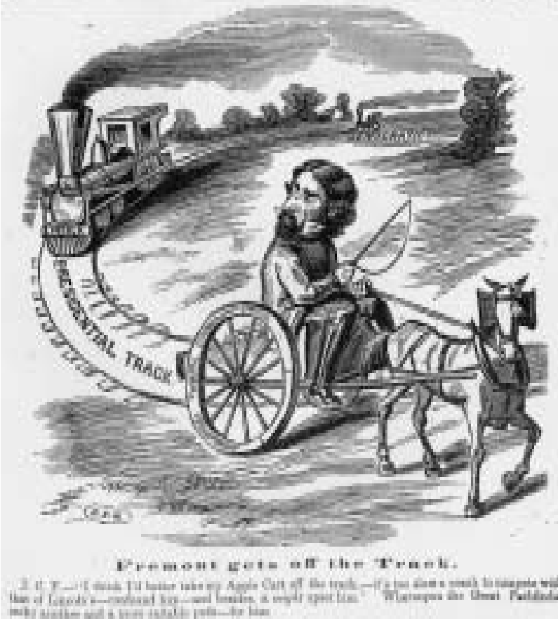
Figure 7. "Fremont gets off the Track."