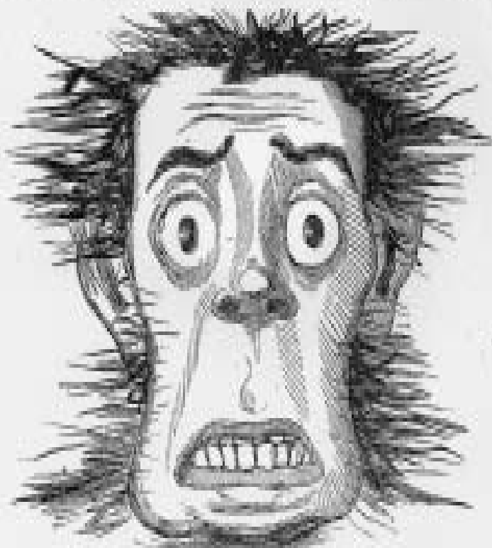
A Portrait, showing the Rage, Agony, Grief, Disappointment and Despair of ye Copperheads, from a sketch taken at the Democratic Headquarters.