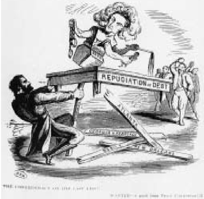
Figure 2. "Stand from Under!!! The Confederacy on His Last Leg!!"