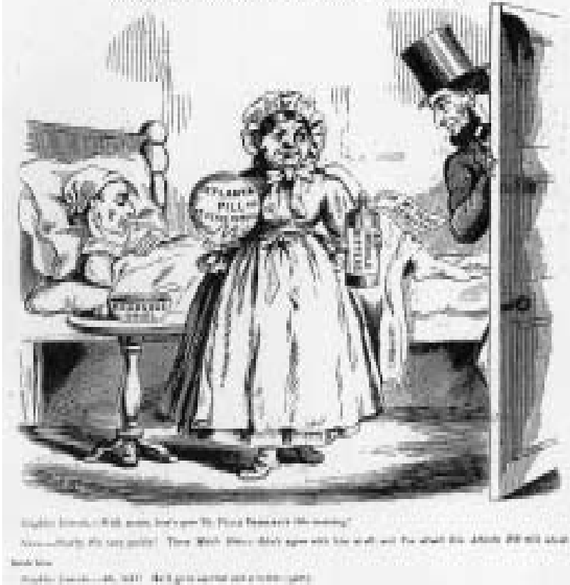
Figure 1. "Alarming Illness of Mr. Peace Democracy."