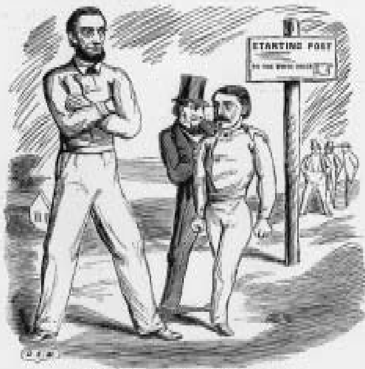
"The Race to the White House."

Little Boy (to everybody)—I tell you I've started to run this race. When I consider his length and his strength, I feel sure, you will not wonder, he's been over the ground before.