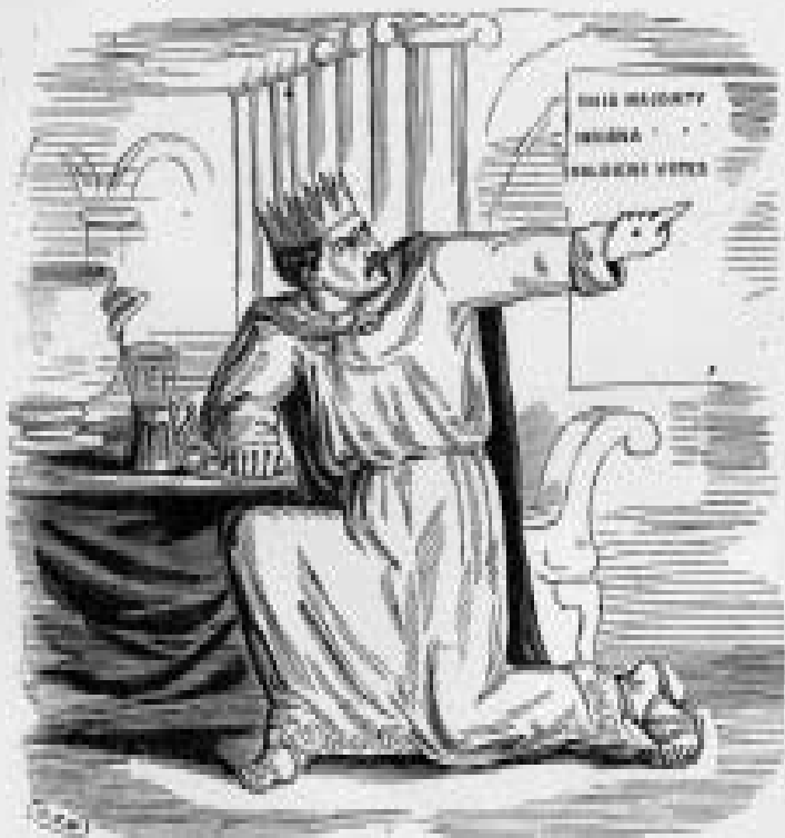
The Modern Belshazzar beholds the terrible "writing on the Wall."