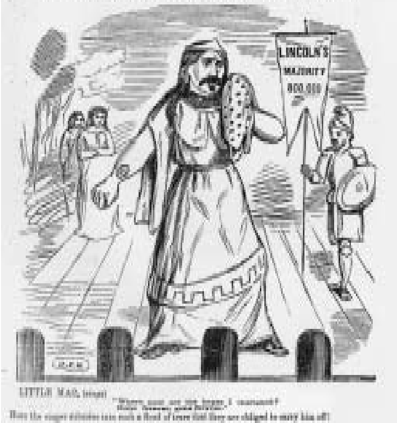
Figure 8. "Little Mac after the Election, takes to the Opera as a means of subsistence. His first appearance in the character of Norma."

Little Mac after the Election, takes to the Opera as a means of subsistence. His first appearance in the character of Norma.